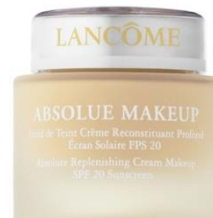
Lancôme Absolué Makeup Cream Foundation