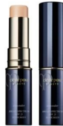
Cle de Peau Beaute Concealer SPF 25

Jillian Shea Spaeder graces the cover of our January issue, check out the full cover story on Page 54